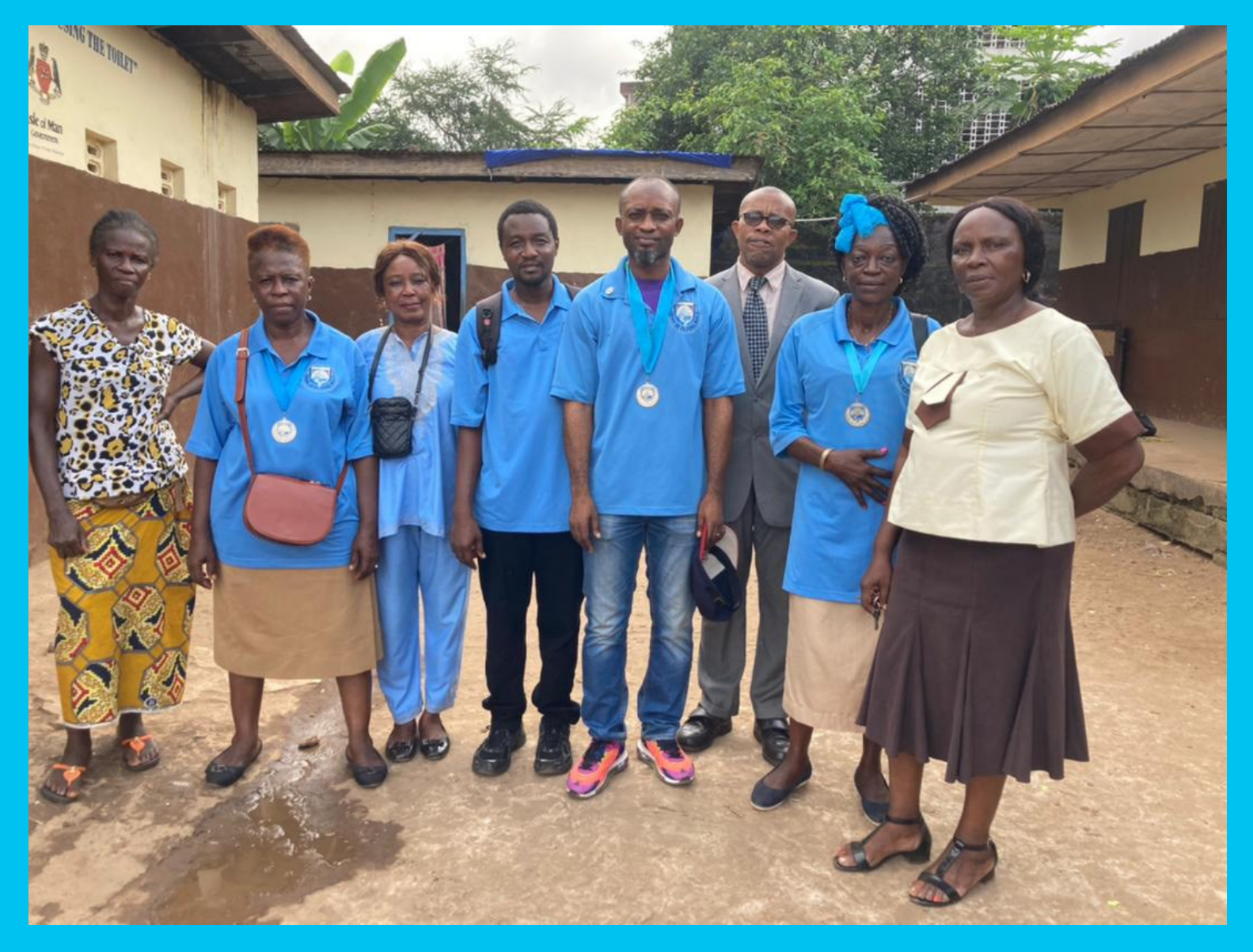
Order supports schools, convents, and orphanages